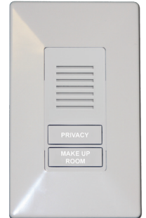
EV564 Guestroom Annunciator and DND / MUR Control