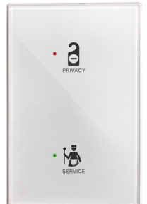
GS564 Guestroom Annunciator and DND / MUR Control