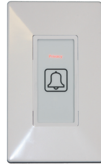
S563 Corridor Annunciator and Doorbell Control