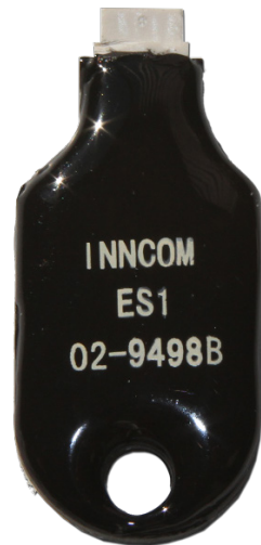
Figure 1. ES-1 Memory Module

It is assumed that the reader is familiar with the engineering options of the e528 thermostat, in particular how to enter, navigate, and execute functions in the thermostat service mode. For information on this topic, consult the e528 User Manual.