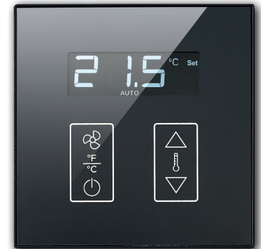
Elements thermostat with Polished Onyx finish