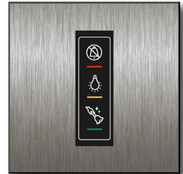
Elements single row switch with lighting control, privacy and make-up-room annunciation with a Brushed Steel finish

The Elements thermostat is an intelligent programmable thermostat providing as much functional flexibility as it does design. It wakes at the first touch and easily allows the guest to see the current temperature and adjust the temperature as they wish. When coupled with one or more occupancy sensors it creates a room-level energy management system (EMS) and will automatically set back the comfort level when the room is unoccupied resulting in significant energy savings for your business.