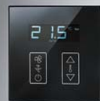
INNCOM Elements Thermostat

Each product is a distinctive fusion of quality and design. The Elements range provides a refined aesthetic that integrates a variety of Honeywell product lines such as PEHA, MK Electric, and INNCOM guestroom controls – ensuring consistent and expressive design options for your hotel.